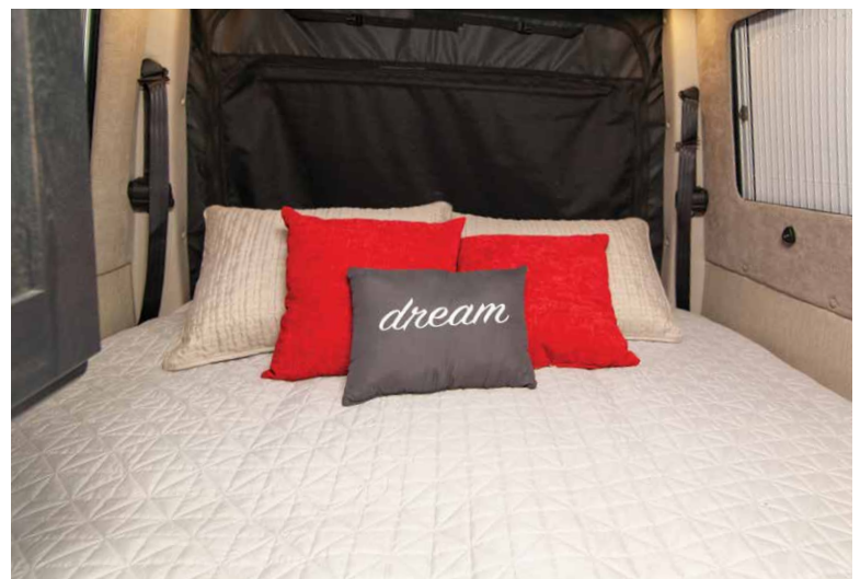
Rear lounge area easily transforms into a sleeping area with a comfortable king size bed.