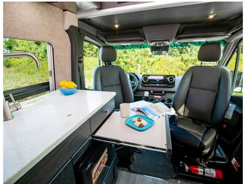
Play, eat or work in the front seating area that is comfortable and roomy enough for two.