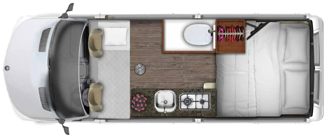
Interior floor plan evening. (With optional front folding mattress.)