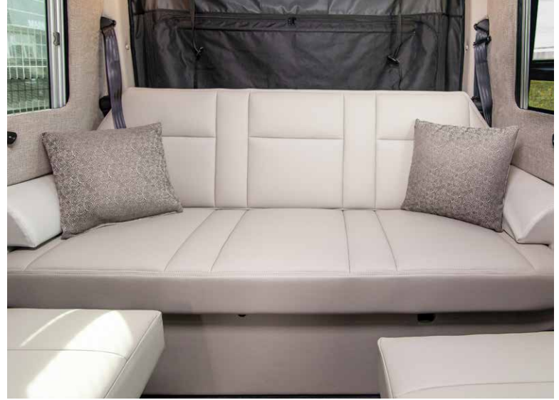
Rear lounge area is a comfortable place to sit, dine or relax and offers seating for up to three passengers.