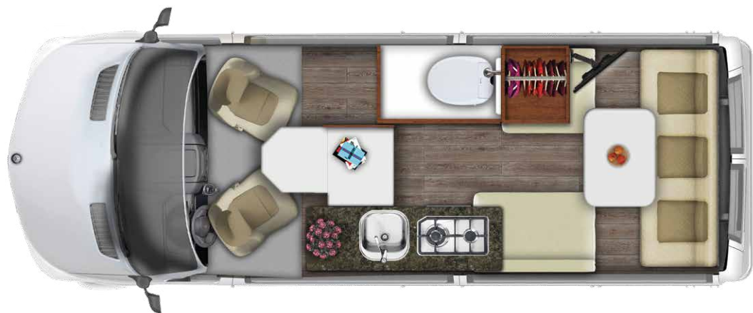
Interior floor plan daytime.